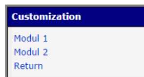
Figure 1: Menu of the Band Select user module for a router with two cellular modules

The web interface available for configuration of the Band Select user module can be invoked by pressing the module name on the User modules page of the router's web interface. The left part of the web interface (i.e. menu) contains only the Return item, to switch back to the router's web interface. In case of routers with two cellular modules, there are Modul 1 and Modul 2 items available to manage both cellular modules of the router separately.